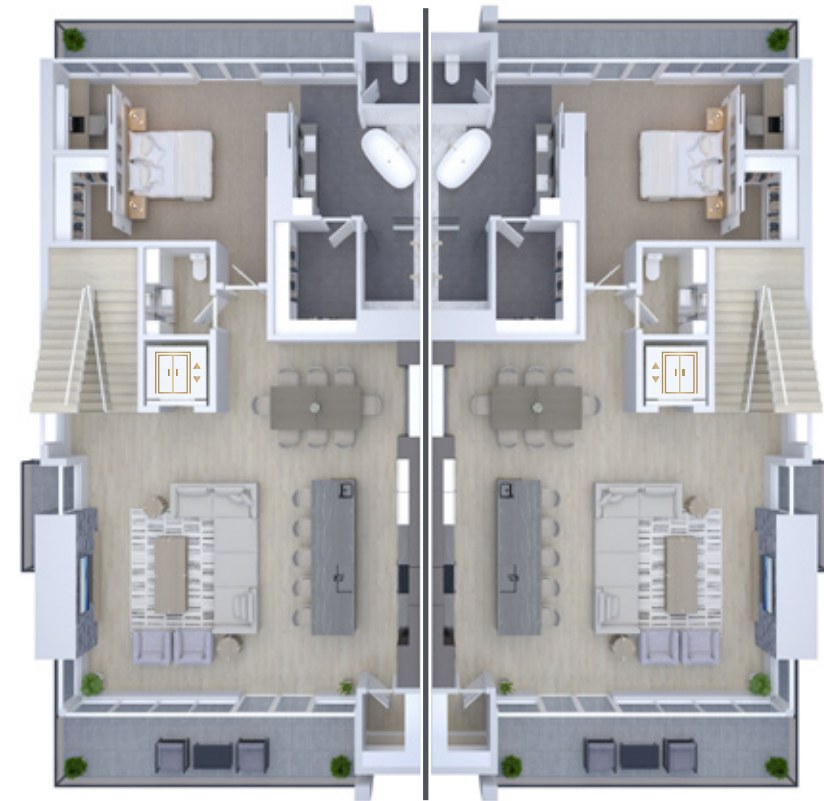
Residence 2 & 6 Level Two Residence 1 & 5