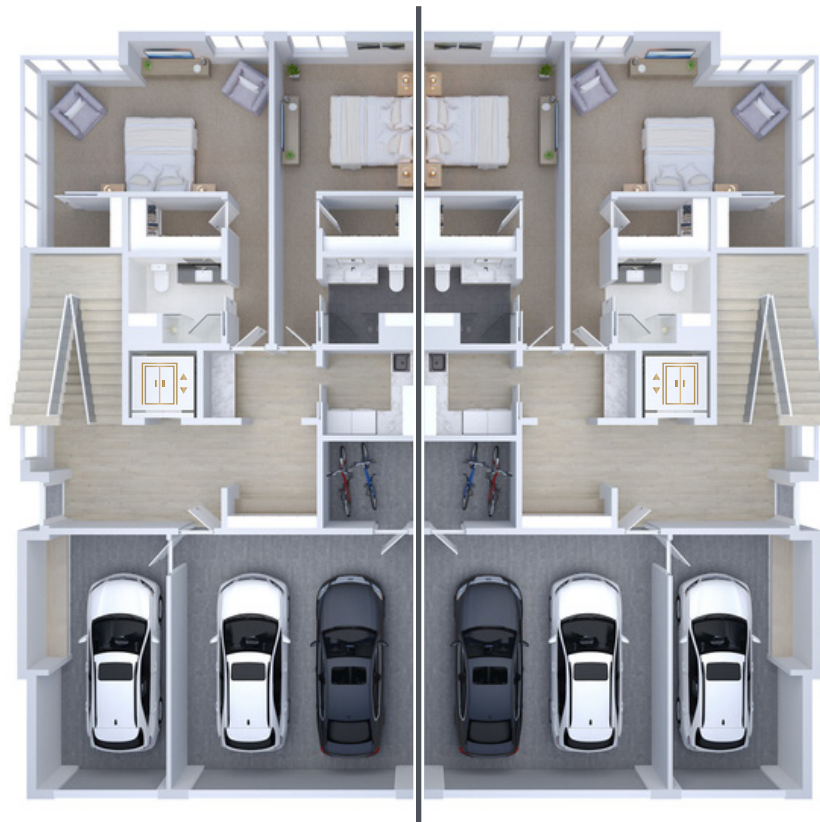
Residence 2 & 6 Level One Residence 1 & 5