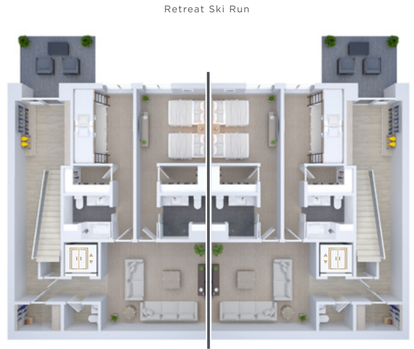
Residence 2 & 6 Lower Level Residence 1 & 5